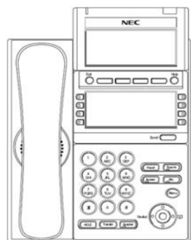
DESI Less 8 Button